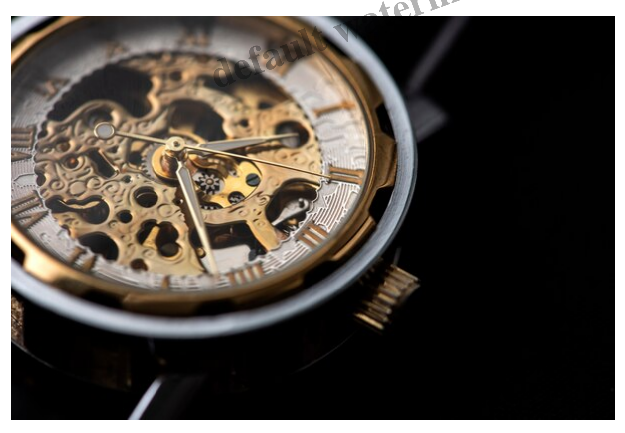
Date Created December 7, 2023 Author lifestar

Let the great beauty and functionality of your most prized timepiece never be ruined by a broken or malfunctioning watch crown. Visit our state-of-the-art repair center today and experience our professional <u>watch repair services</u> that will give your watch new life, allowing you to enjoy its timeless allure and performance for years to come.