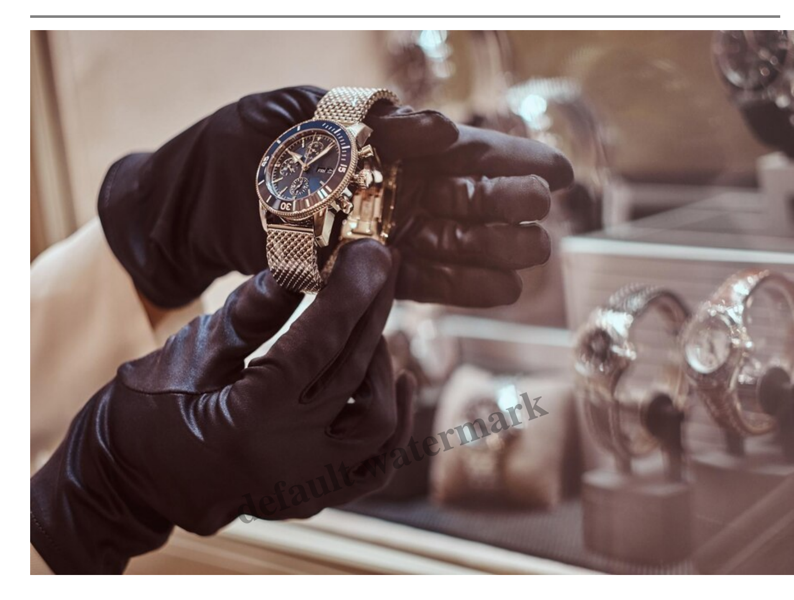
Revive Your Watch's Brilliance: Expert Watch Cleaning and Polishing Services

Welcome to WeFixAnyWatch, your destination for complete cleaning and polishing of watches designed to bring back your beauty to its former glory. With time, watches undergo tarnish and scratches that make them look dull and ugly in appearance. Our professional watch polishing service is designed to target those issues and return their brilliance.