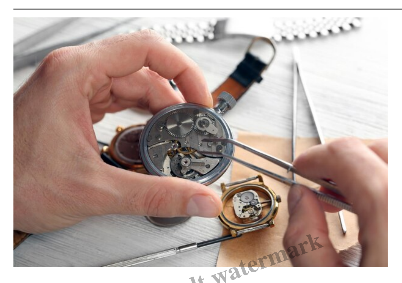
Enhance Your Watch's Fit and Style: Experience Our Watch Link Adjustment Service

At WeFixAnyWatch, we understand how very important a properly fitted watch that balances comfort with style is. That's why we provide a convenient watch link adjustment service to make your timepiece fit as it should.